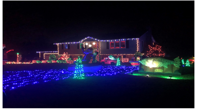
Light Up New Oxford residential decorating contest second place winner Merry Fishmas located on Piper Dr.

The New Oxford Area Chamber of Commerce recently announced the winners of New Oxford Holiday Hunt, which wrapped up at the end of December. The winners of the scavenger hunt, business decorating contest and residential decorating competition were shared on the Chamber's Facebook page.