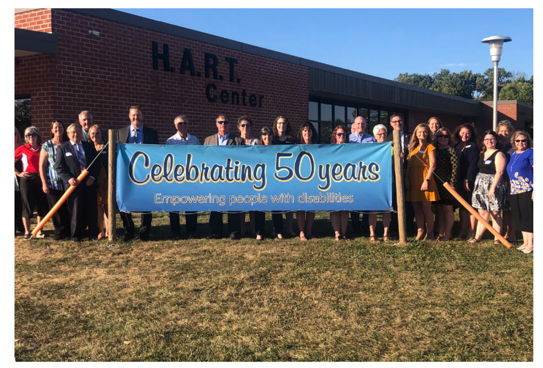
Representatives from the New Oxford Area Chamber of Commerce, Hanover Area Chamber of Commerce, The Chamber of Gettysburg & Adams County, the HART Center staff and dignitaries from the state and Adams County pose by the 50th anniversary banner.

Members of the New Oxford Area Chamber of Commerce, Hanover Area Chamber of Commerce and The Chamber of Gettysburg & Adams County joined the HART Center to celebrate its 50th anniversary on Wednesday, September 25.