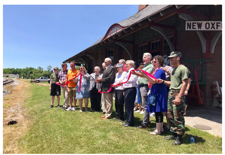
Ribbon cutting at the train station on Sunday, June 23.

Congratulations to the NOAHS and the town of New Oxford on this achievement that was made possible through the collective efforts of the people of this small town. The train station and its property can now continue to be enjoyed by generations to come!