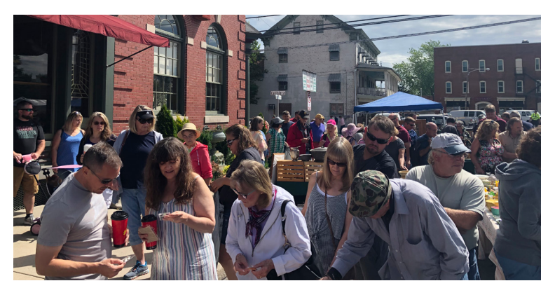
For additional photos from this year's event, please visit our Facebook page (New Oxford Area Chamber of Commerce)!