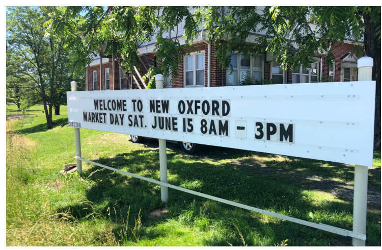
Restored sign on the east end of New Oxford

To see more pictures of the restoration process and before and after photos, please visit our Facebook page.