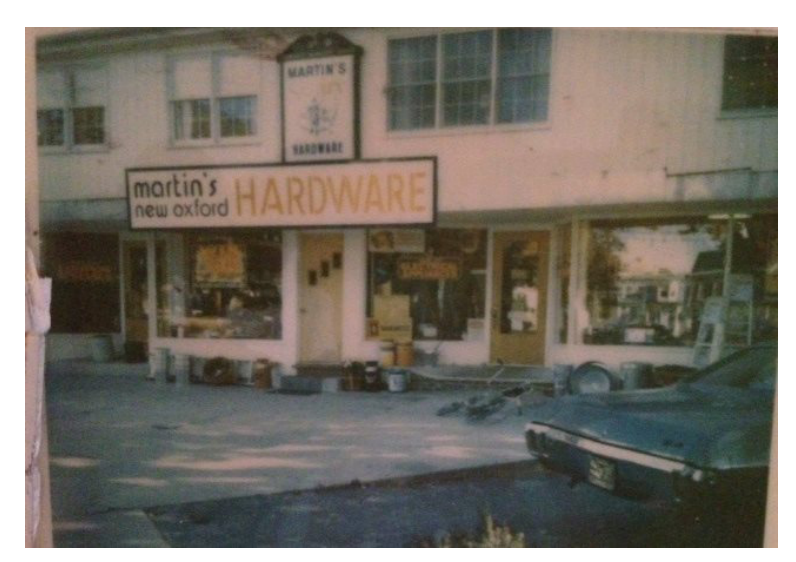
Martin's New Oxford Hardware, Inc. in 1974

We are excited to introduce the "Member Spotlight" series to our readers. Each month, we will take an in-depth look into one of our Chamber members and the history of their business or organization. Look for a new spotlight in each quarterly newsletter. For the months when a newsletter is not released, you will be able to find the latest "Member Spotlight" on our blog and on our Facebook page. For our first edition of this new series, our featured member is Martin's New Oxford Hardware, Inc. a long-time staple of the New Oxford community. Read on below to learn more about this beloved local business.