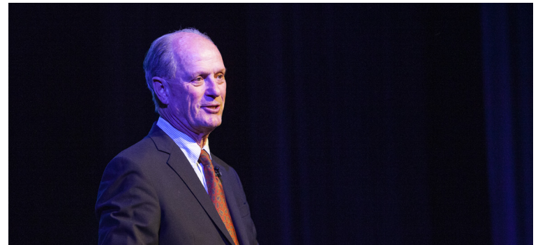
Keynote speaker Dr. Robert Ballard

The Manufacturers Association of South Central Pennsylvania (MASCPA) hosted its 113th Annual Event on April 25 at the Pullo Center in York. The event is an opportunity to publicly recognize and honor member companies and partners making a difference in the regional economy, lives of their employees, their communities and the local manufacturing sector. The keynote speaker for the event was oceanographer and explorer Dr. Robert Ballard, who discovered the Titanic. Approximately 600 guests from throughout South Central Pennsylvania and Northern Maryland attended the event.