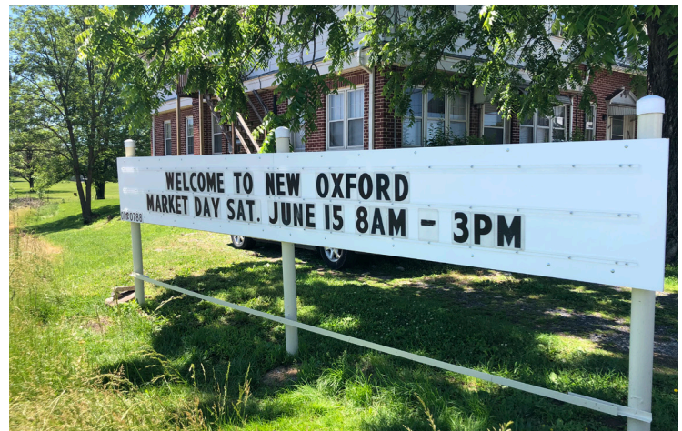
Restored sign on the east end of New Oxford

To see more pictures of the restoration process and before and after photos, please visit our Facebook page.