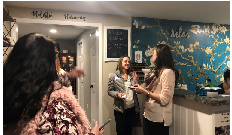
February Mixer at Holistic Harmony in New Oxford

Thank you to Holistic Harmony for hosting the Chamber's first mixer of 2019 on February 19.